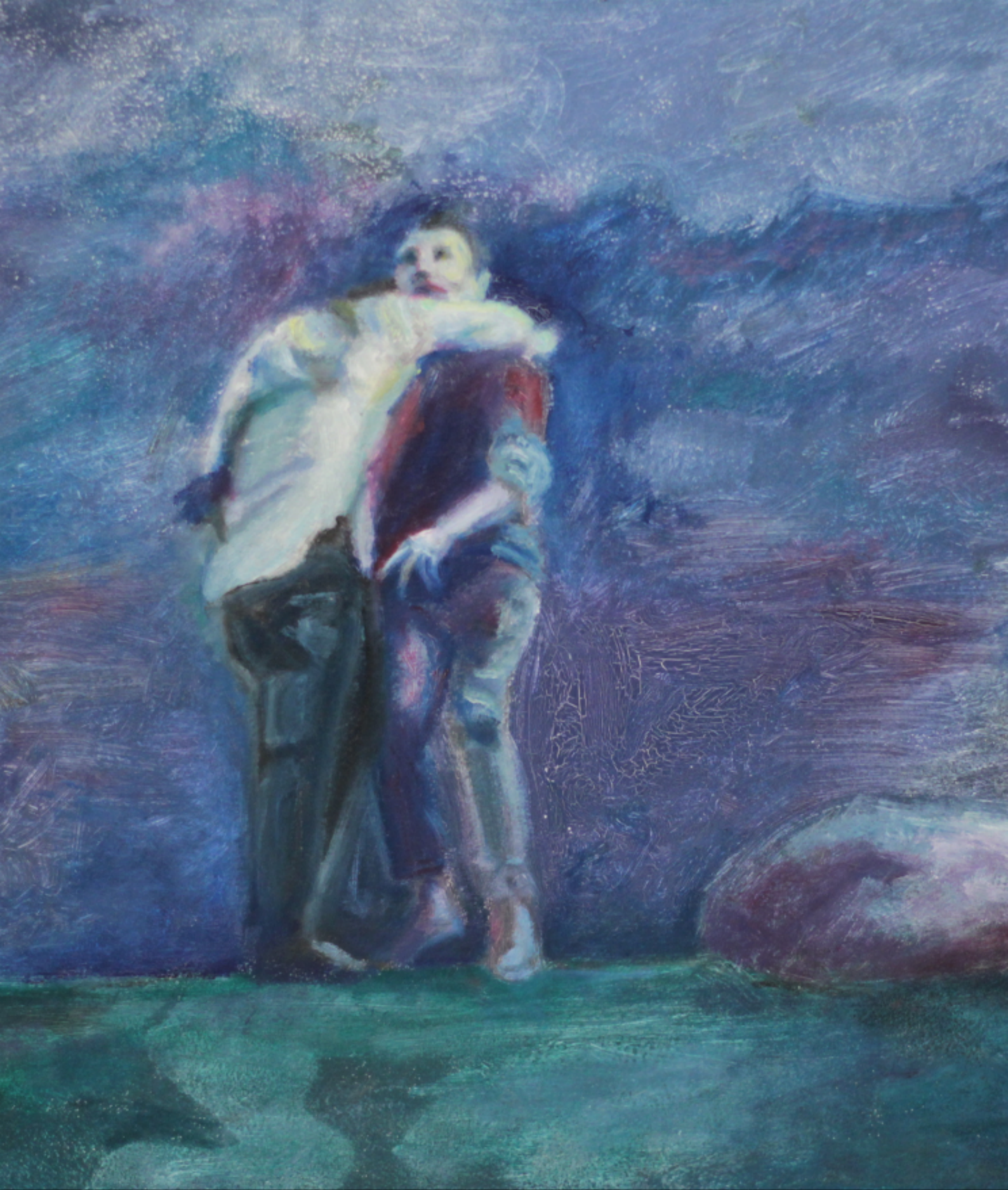
The Embrace oil on wood, 2015