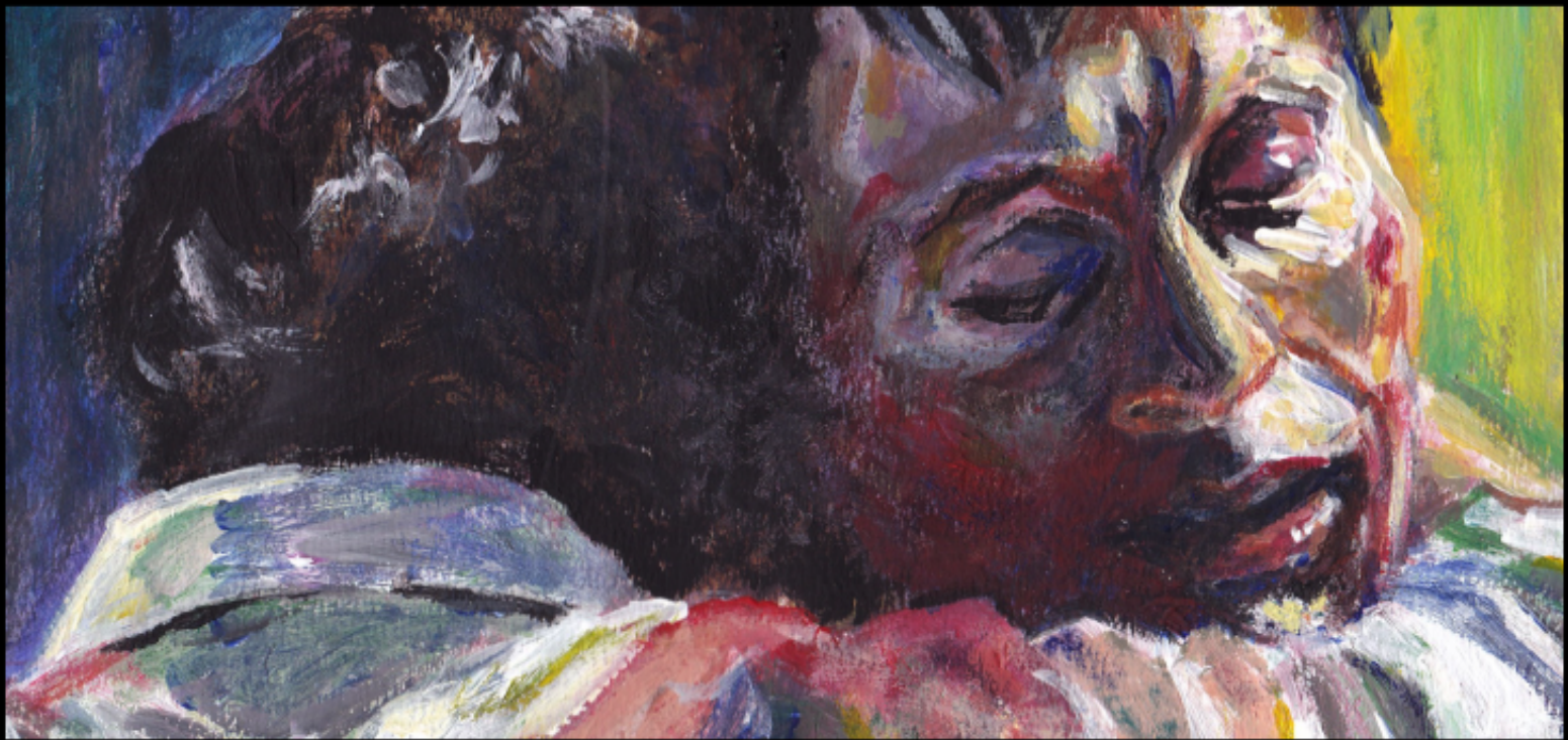
acrylics on paper, 2016