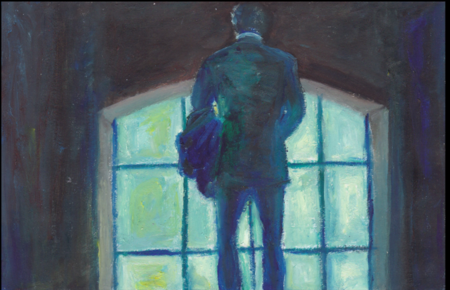
acrylics on paper, 2016