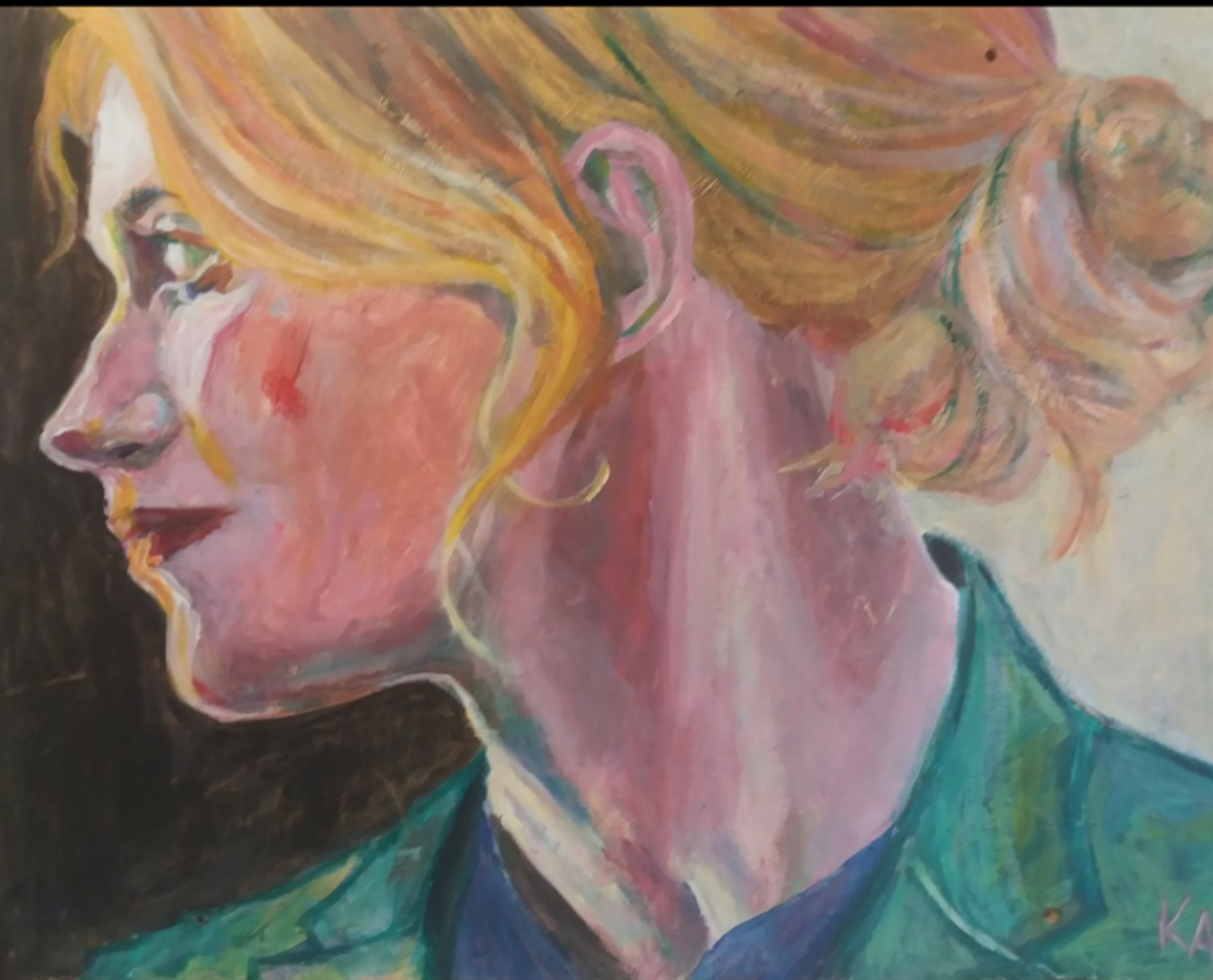
Golden girl acrylics on wood, 2017